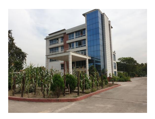
Seminar Venue: Institute of Medical Physics (INMP) established in 2018 at Atomic Energy Research Establishment (AERE), Atomic Energy Commission, Savar, Dhaka. Bangladesh.