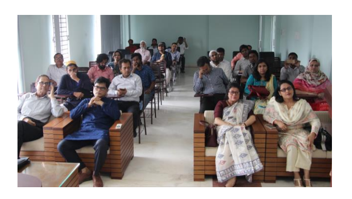
Audience during the Seminar