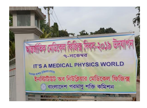
Entrance of Institute of Medical Physics (INMP) was decorated to mark IDMP-2019