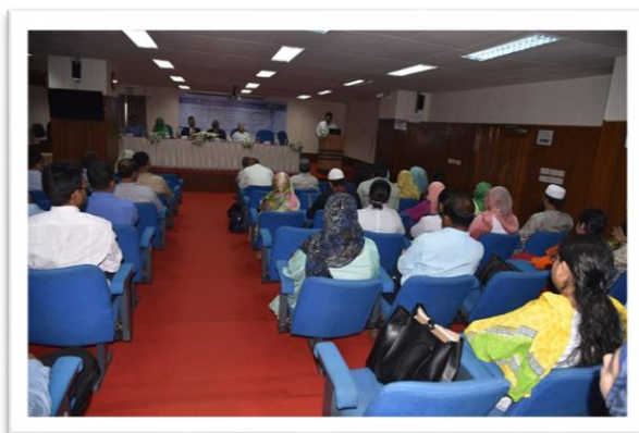
Audience during the programme.