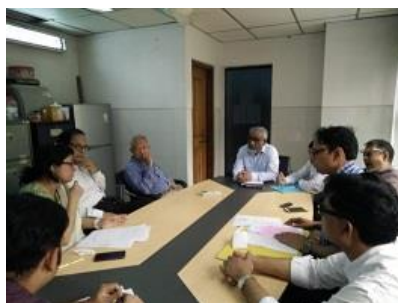
Meeting BAEC with BPA

For the training and development of Medical Physicist in Bangladesh a Nuclear Medical Physics Institute (INMP) and Radiotherapy Center is established in Bangladesh Atomic Energy Commission in 2017 under Bangladesh Government Annual Development Program (ADP). To improve the quality of radiotherapy treatment an ADP project titled "Radiotherapy, Diagnostic Radiology and Neutron Calibration and Quality Control Facilities" is a ongoing project at SSDL for the development of Medical Physics in Bangladesh.