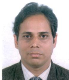
The elected President and General Secretary respectively of Bangladesh Medical Physics Association (BMPA).