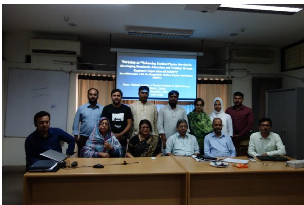
Workshop on RCA/IAEA

A workshop on RCA/IAEA project “Enhancing Medical Physics Services in Developing Standards, Education and Training through Regional Cooperation (RAS6087)” in Collaboration with Bangladesh Medical Physics Association was held at NINMAS, November 2 2018.