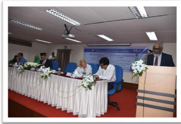
Mahbubul Hoq, Chairman, Bangladesh Atomic Energy Commission (BAEC) addresses during the occasion