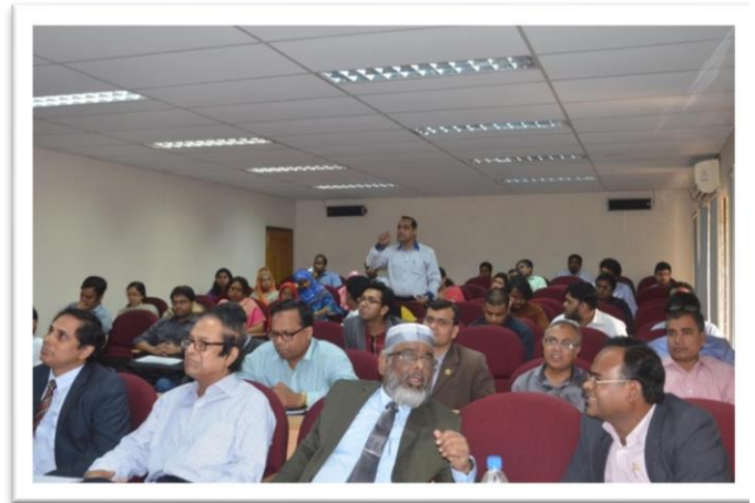
Audience during the seminar on Standards and Applications of Radiation in Medicine