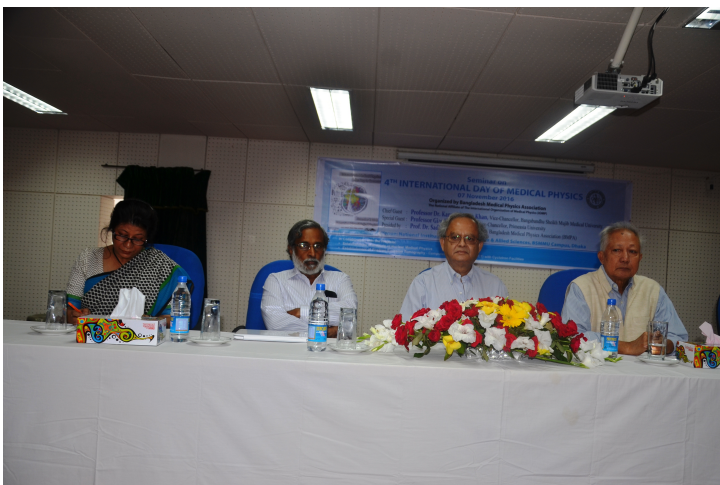
Speakers of the Seminar